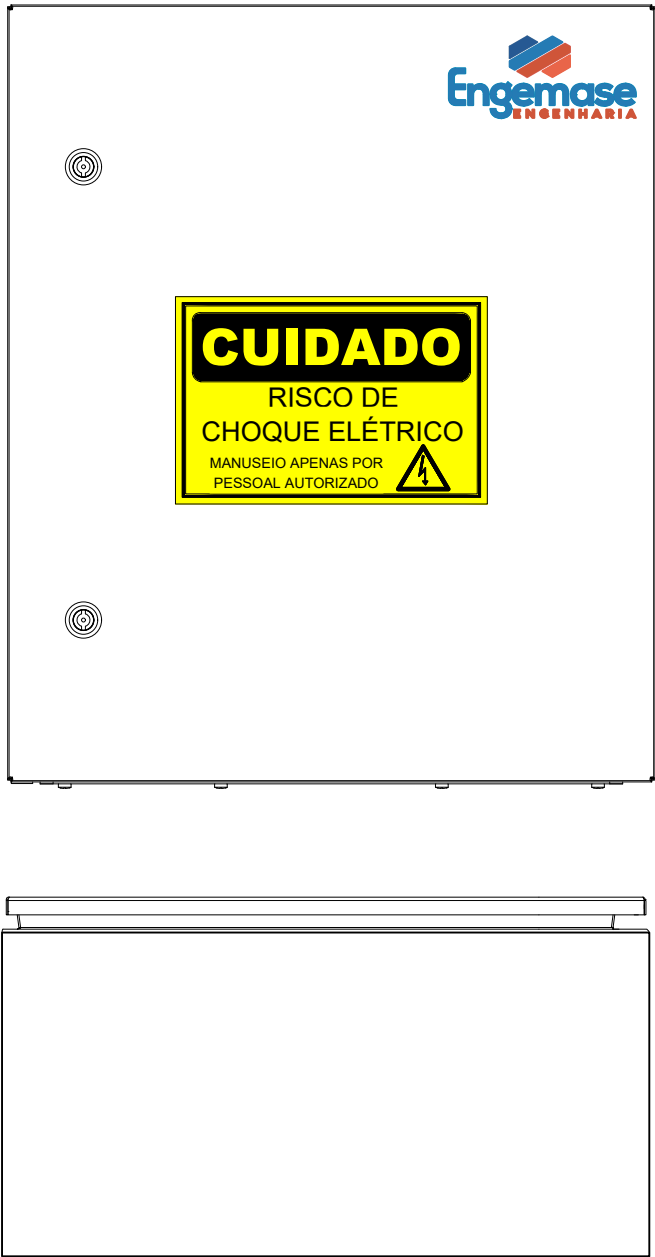
VISTA FRONTAL EXTERNA